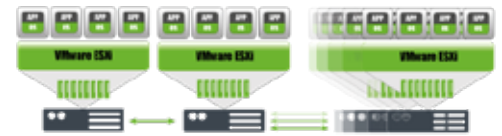
Hyper-Converged Cloud Architecture Diagram